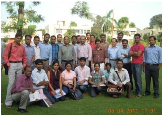
Students of MPS during their study tour

By attending the conference, the students got an opportunity to learn from the proceedings and deliberation of the conference and were also able to meet many demographers, researchers, government officials and other experts working in the field of population and development.