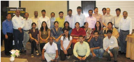
Participants of HUP questionnaire finalisation workshop

The questionnaire finalisation workshop of "Health of the Urban Poor Project" was held at Best Western Resort, Manesar, Gurgaon in Haryana, during 30-31 March 2011.