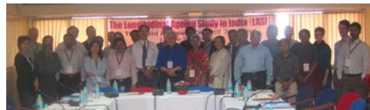
Participants of 3 rd Advisory committee meeting of LASI

The overview of the Pilot-LASI survey was presented at the conference on ‘Policy Research and Data Needs to Meet the Challenges and Opportunities of Population Ageing in India’, organised by the Indian National Science Academy and US National Science Academy in New Delhi during 14-15 March 2011.