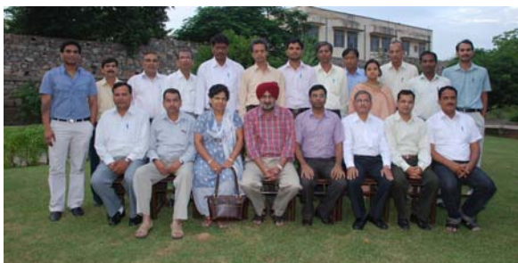
Group photo of TDLO participants at IDS, Jaipur (20-24 September, 2010)

The 'Training of District Level Officers' (TDLO) project was undertaken by IIPS, which is funded by the UNFPA. The main objective of the project is to train the district level officers on the use of demographic data for district level planning and development.