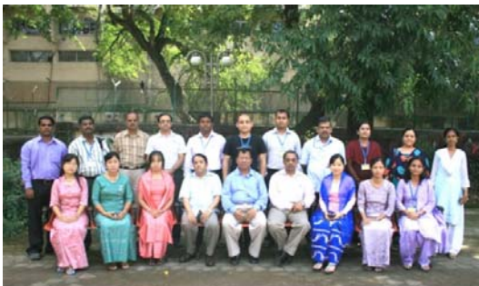
Participants from Malawi, Myanmar and Bhutan, who attended the short term training programme at IIPS

4. Training on “Application of SPSS for Data Analysis” was conducted for 15 participants during 13 - 17 September, 2010. Among the participants, five were from Myanmar, Ministry of Immigration and Population, Central Statistical organization, three from U.P. State Institute of Health and Family Welfare and others were officers from National Federation of State Cooperative Bank, Lecturer, Consultants, Medical Officers and Research officers.