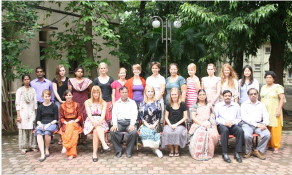
Participants from Nordic countries who attended the short term training programme at IIPS

4. Training on “Application of SPSS for Data Analysis” was conducted for 15 participants during 13 - 17 September, 2010. Among the participants, five were from Myanmar, Ministry of Immigration and Population, Central Statistical organization, three from U.P. State Institute of Health and Family Welfare and others were officers from National Federation of State Cooperative Bank, Lecturer, Consultants, Medical Officers and Research officers.