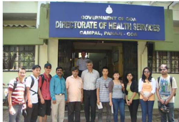
Students of MA /M.Sc. programme at the Directorate of Health Services, Goa, during their study tour

This year the first batch of MA/M.Sc. students were taken on a study tour during 28 th February to 13 th March, 2011 as a part of the academic programme. They visited 12 reputed institutions in major South Indian cities, i.e., Hyderabad, Bangalore, Panaji (Goa), Chennai, Pondicherry, Gandhigram, Madurai, Thiruvananthapuram and Kanyakumari.