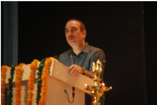
The GATS national report was released by Honourable Shri Ghulam Nabi Azad

The National Report of the GATS India was released by honourable Shri Ghulam Nabi Azad on 19 th October, 2010 at the auditorium of RML Hospital, New Delhi.