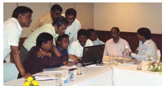
Participants of a training workshop for mid-level health programme managers

Third, fourth and fifth workshops were organised during 11-13; 18-20 and 24-26 November, 2010 at IIPS, Mumbai. A total of 71 mid level managers from different districts namely Nashik, Parbhani, Kolhapur, Gondia, Thane, Nagpur, Raigad, Jalna, Solapur, Aurangabad, Satara, Sangli, Wardha, Pune, Beed, Latur, Jalgaon, Akola, Dhule, Osmanabad, Yavatmal, Chandrapur and Buldhana attended these workshops.