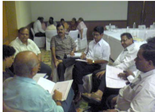
A group of participants attending in the TMLM workshop were busy in debating on various issues and strategies to strengthen the JSY in the state

Ninth and the tenth training workshops were held at Hotel Rama International, Aurangabad during 27-29 April and 4-6 May, 2011.