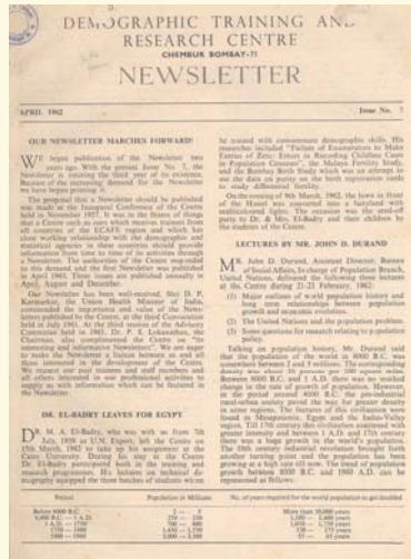
Fig. 2 Cover page, 1961