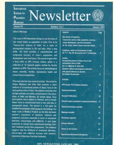
Fig.4 Cover page, 2004