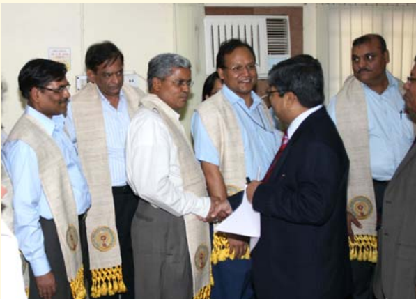
Prof. Bhalchandra Mungekar interacting with the faculty