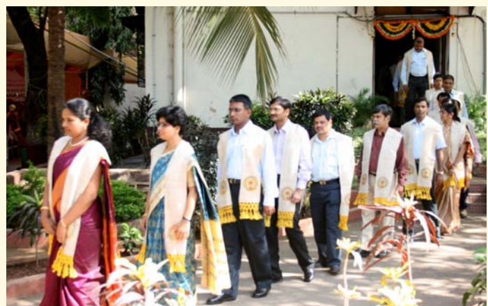
Academic procession heading to the convocation venue