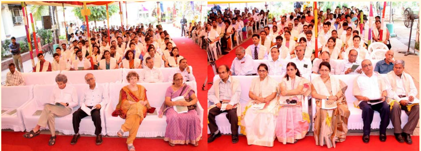
Honourable guests, retired professors, faculty, students and visitors at the convocation