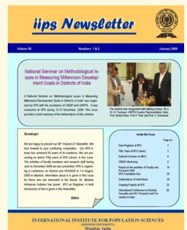
Fig.5 Cover page, 2006