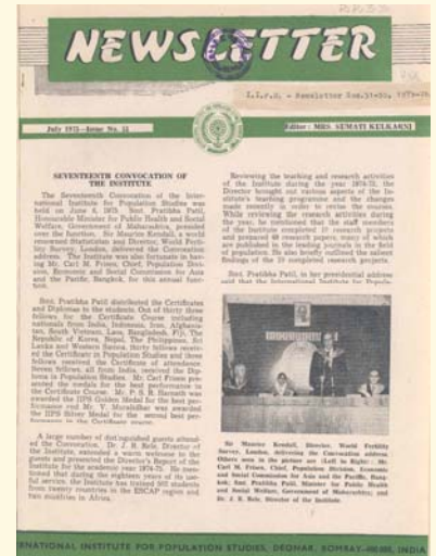
Fig. 3 Cover page, 1975