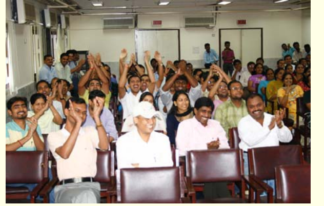
कवि सम्मेलन का आनंद लेते हुए संस्थान के कर्मचारीगण एवं छात्र ।